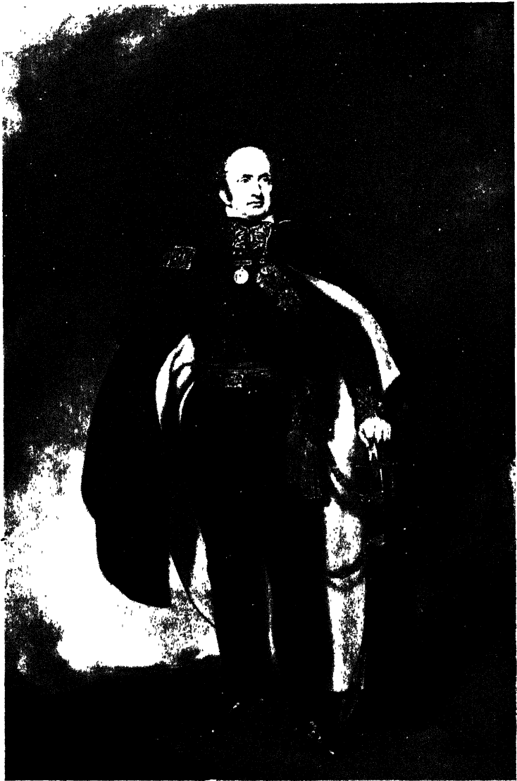
MAJOR GENERAL. SIR JOHN MALCOLM, G.C.B. From a portrait in the possession of the Oriental Club, London.